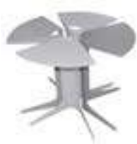
PickUp Four tables, grouped