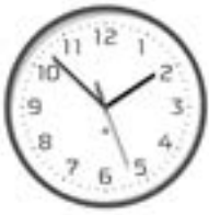
820 Shown with Face Number 36