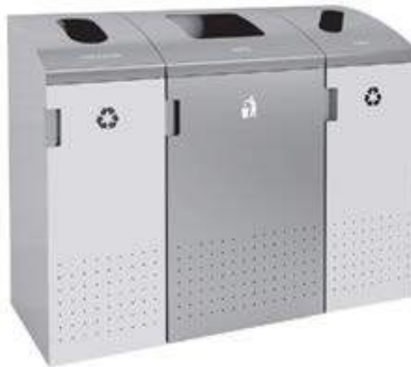
(2) RS14 and (1) RS20