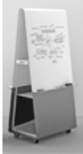
ME36 - MeetUp Mobile Easel