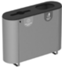
Duo Shown with D3 Top Opening