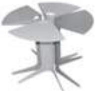
PickUp Four tables, grouped