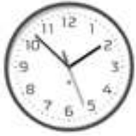
820 Shown with Face Number 36