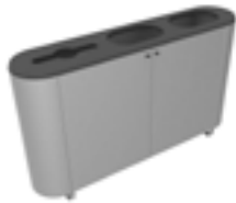
Trio-S Shown with T1 Top Opening